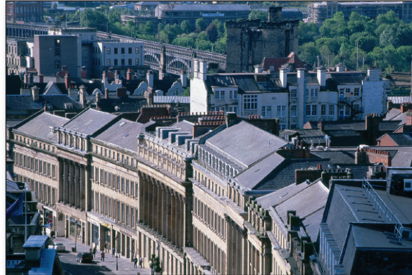
Grey Street from the Grey Monument.