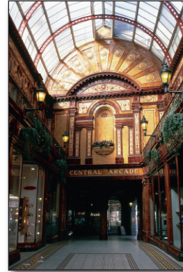
The Central Arcade.