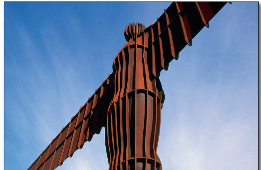
A lay-by on the A167 allows easy access to visit Antony Gormley's towering Angel of the North.

Opposite: Unreal city: Millennium and Sage, like a futuristic Venice.