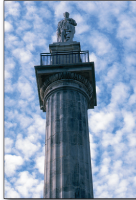
The Grey Monument.