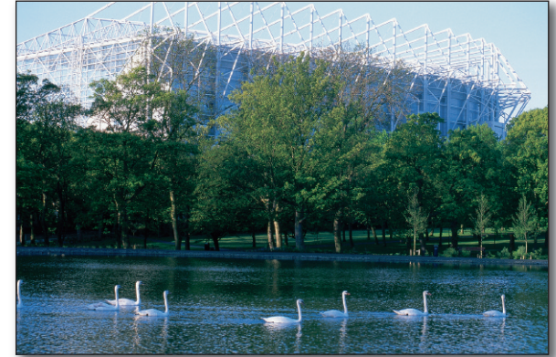
The quieter side of St James' Park; mute swans in Leazes Park.

A spring morning, looking west from the Gateshead side of the Tyne Bridge over the Swing Bridge to the Guildhall and Sandhill.